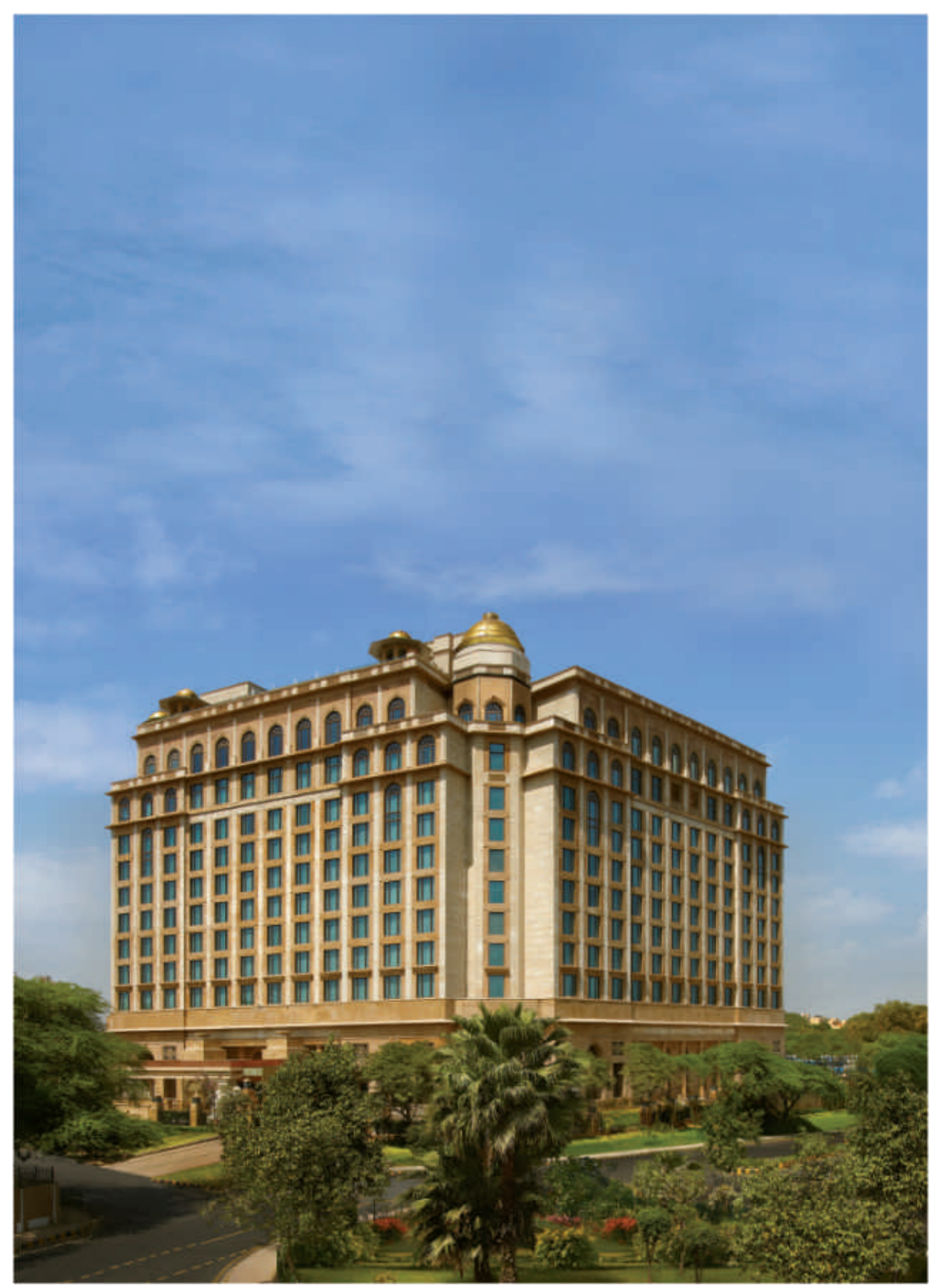
The Leela Palace New Delhi